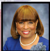
Lula Davis-Holmes Mayor

Please email sportscomplex@carsonca.gov or call (310) 830-9991 for more information